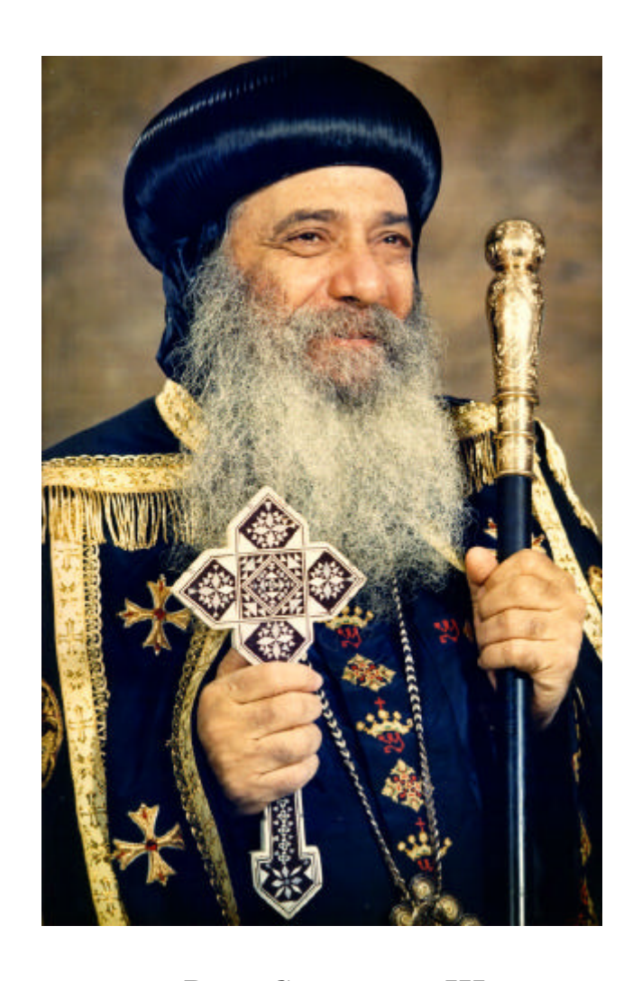
POPE SHENOUDA III POPE OF ALEXANDRIA AND PATRIARCH OF THE SEE OF ST. MARK