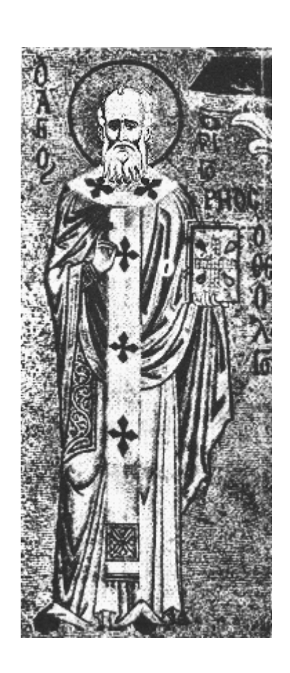
St Gregory of Nazianzus known as the Theologian